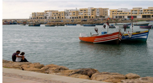
Rabat, Morocco